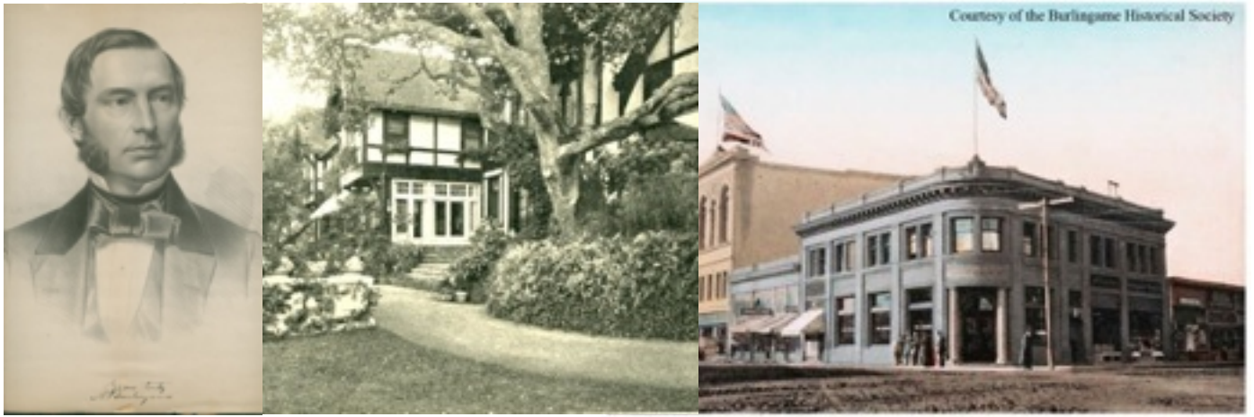
Above left to right: A rare signed lithograph of a young Anson Burlingame, the city's namesake; an early photograph of the Pope Estate, in Hillsborough; The Bank of Burlingame (now Straits Restaurant) and the Masonic Hall "skyscraper" were the pride of Burlingame in 1912 when the city's streets were still muddy.

Without the countless volunteer hours spent by our archive crew, our 130,000 item collection would be meaningless. The volunteers not only ensure that your donations are well preserved, but they file and catalog them meticulously, so that we can access them for research and display. THANK YOU TO ALL!